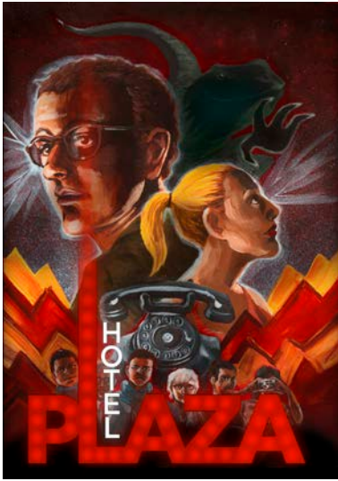
The Night of the Lizard (2012) - director short feature, shot on 35mm