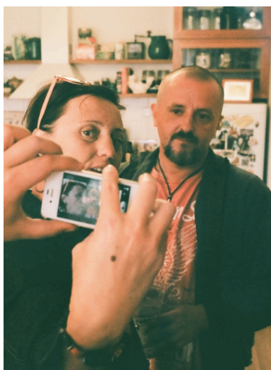
Woman from the past (2013) - short, director Best Foreign Film at REC FEST, Zlín