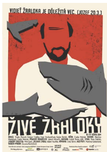
Živé žraloky (2014) - short, director Eastern NC Film Festival USA - selection