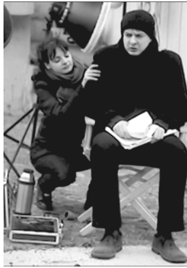
Sántántangó (2012) - short, director Best directing - Festival Áčko