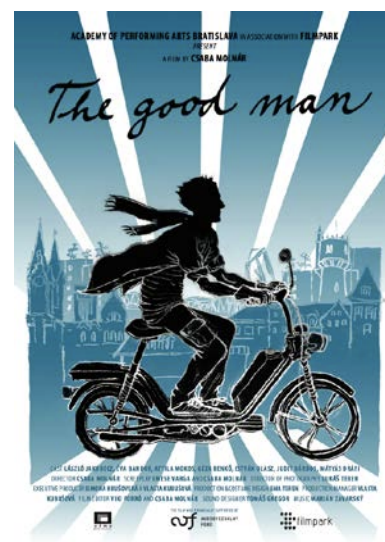
Dobry člověk (2013) - director Best directing in student feature film - IGRIC